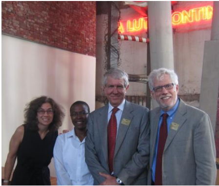
Entrance to South African Constitutional Courtroom