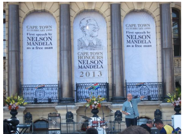
Memorial service at Cape Town

With exuberant pride, local residents repeatedly recited who from abroad was coming to South Africa to honor their Madiba. And they had reason to be proud because the memorial service was one of the largest gatherings of heads of states other than at the United Nations. Nearly a hundred heads of state came, including President Obama and three former U.S Presidents and David Cameron and three former British prime ministers. Speakers included Obama and UN Secretary General Ben Ki-Moon.