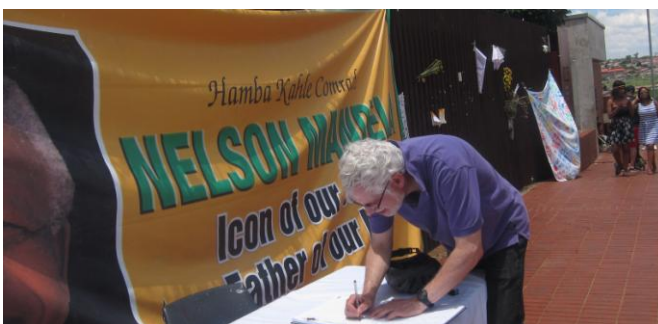
Signing Memorial Book at Mandela's Soweto Home

We also heard the loud jeering of the President of South Africa, Jacob Zuma, when he spoke. The unpopular president faces corruption charges in a country with gross income inequality and deep political divide. And we read for days the unfolding, bizarre story of the sign language interpreter who gave meaningless gestures while standing within a few feet of President Obama. The government-hired interpreter told the media afterwards that he was a "violence-prone schizophrenic."