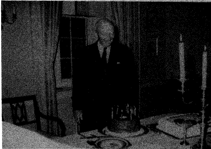
Justice Black at the dinner table next to his chair February 27, 1966