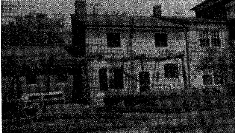
Backyard view of 619 South Lee Street in October of 1956. (Center) clerk apartment & grape arbor. (Left) The bench where Justice Black discussed Brown v. Board of Education. (Right) The main house.