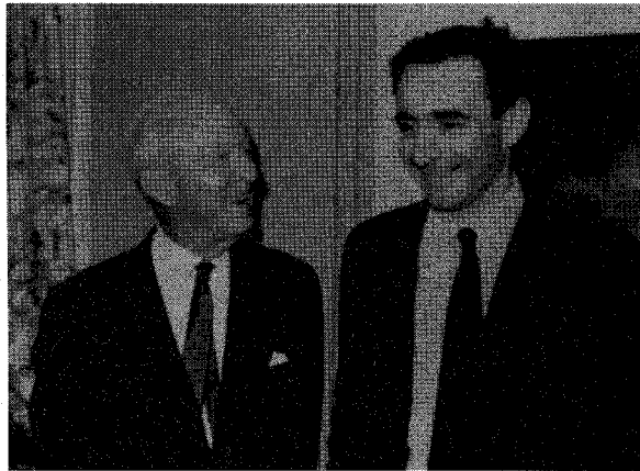
Justice Hugo L. Black and Charles Reich February 27, 1966